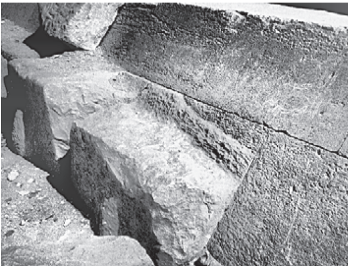
3. The north-east corner of pyramid G I-c.