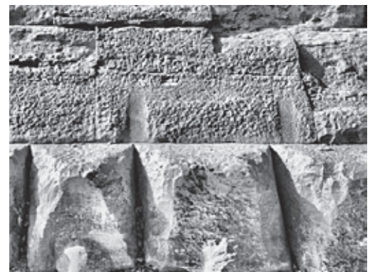
6. The south side of pyramid G I-c.