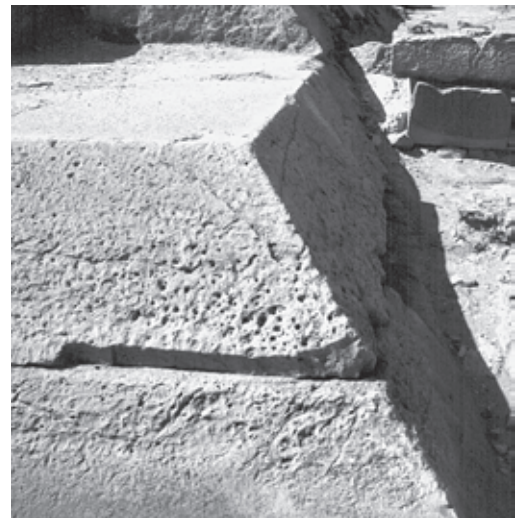
4. The west side of pyramid G I-c.