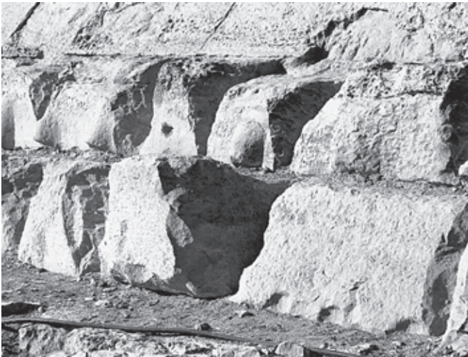
1. The south side of pyramid G I-c.