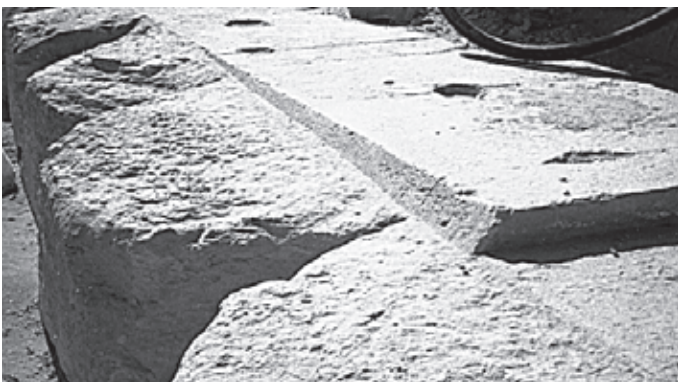
5. The south side of pyramid G I-d.