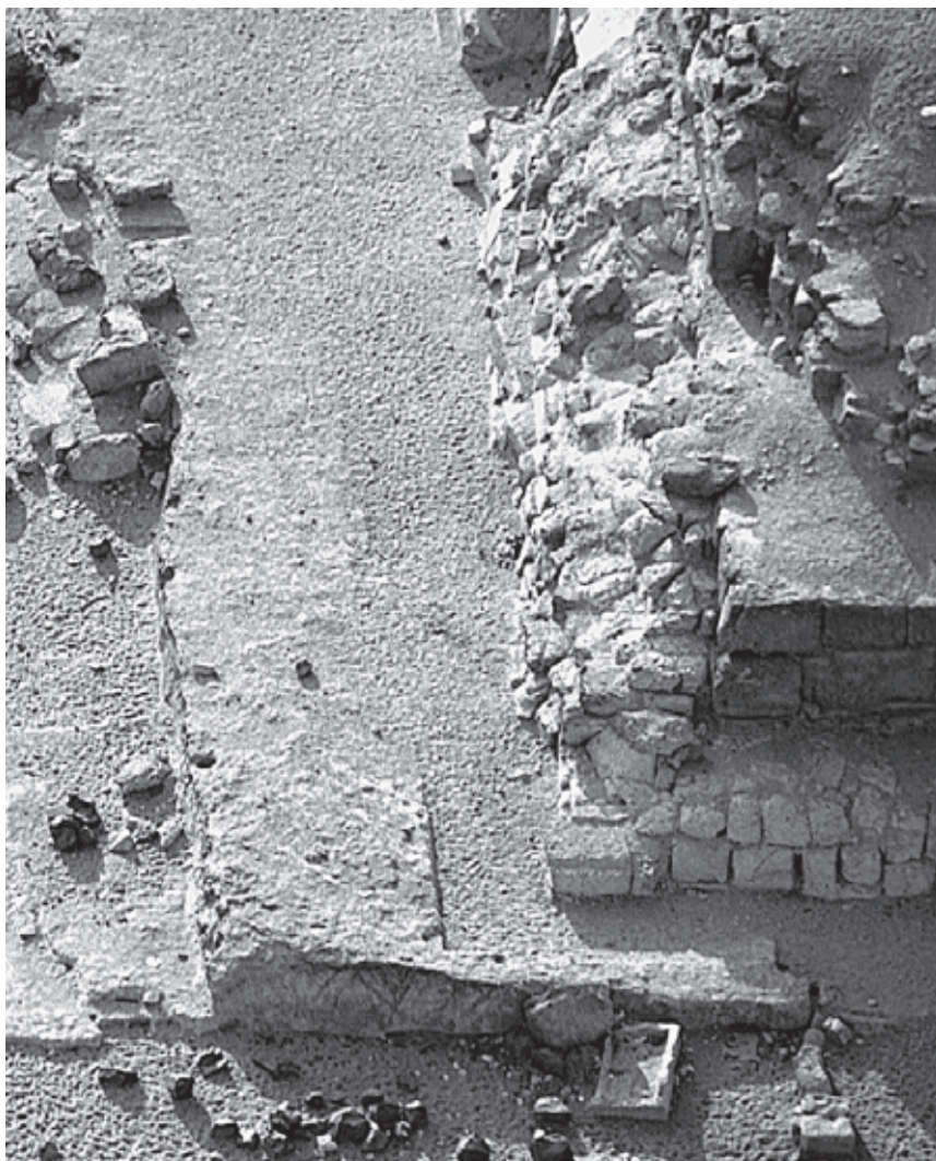
7. The north-west corner of pyramid G I-a.