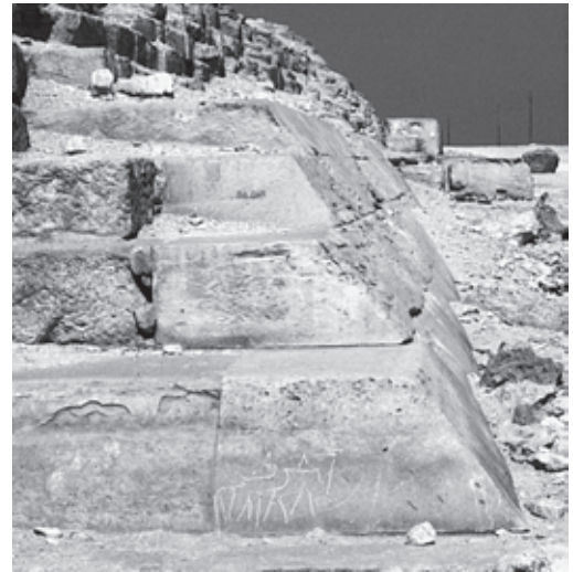
2. The south-east corner of pyramid G I-b.