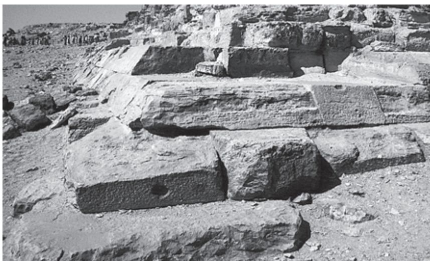
8. The south-east corner of pyramid G I-c.